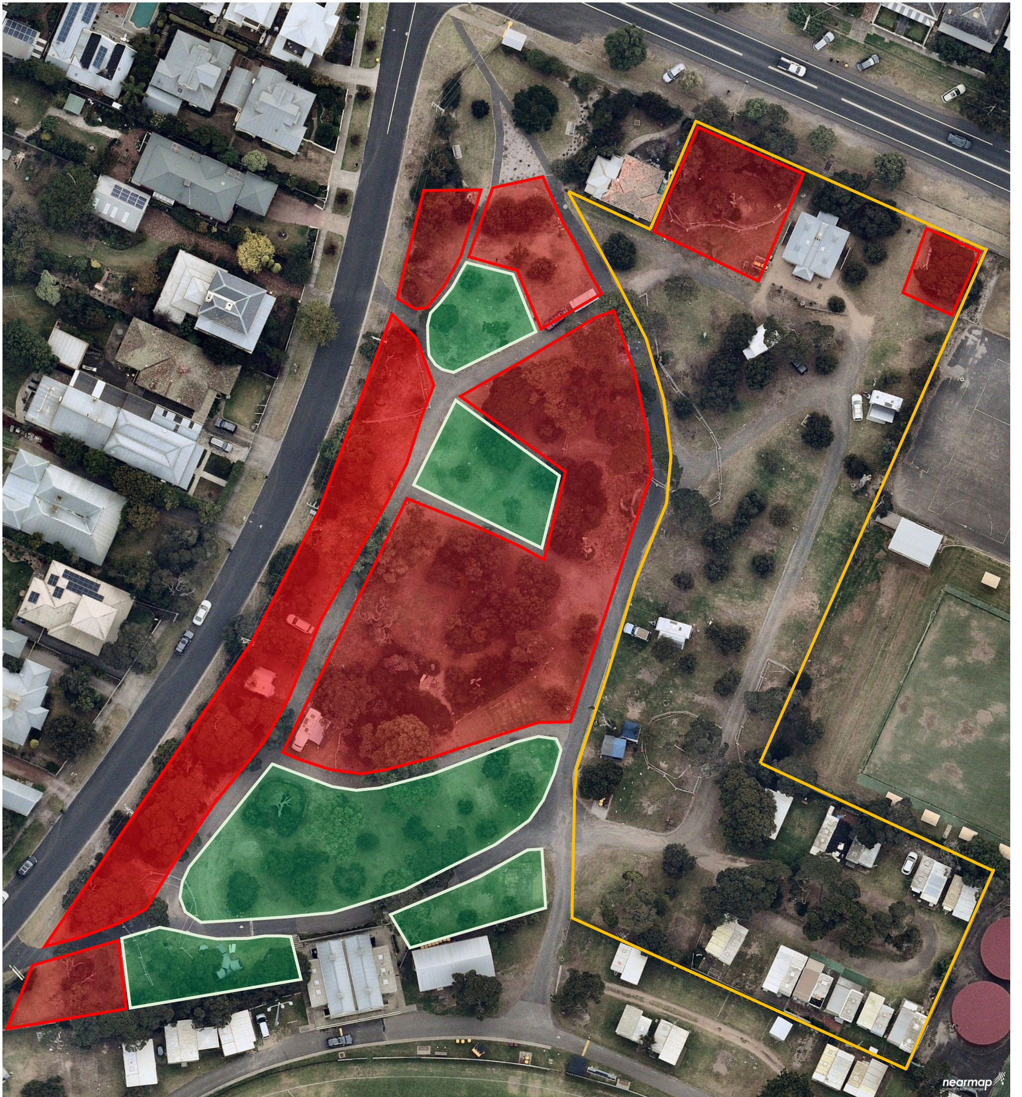
Victoria Park Plan 2022