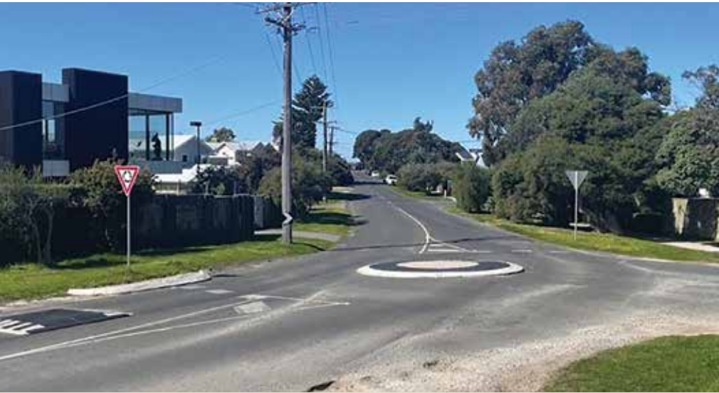
The roundabout trial on Kirk Rd has concluded.