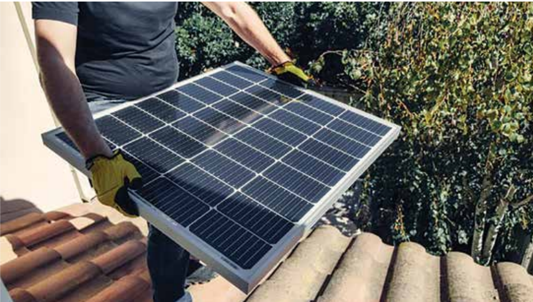
QCAN will help locals learn more about 'going solar.'