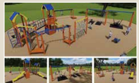
The new Ganes Reserve playground will feature bright and engaging play equipment to excite children of all ages.

The equipment is designed to marine grade specifications, allowing the materials to withstand the risk of corrosion in a coastal environment. Best of all, the nearby trees and seating will be retained during the renewal. Construction is expected to begin in June.