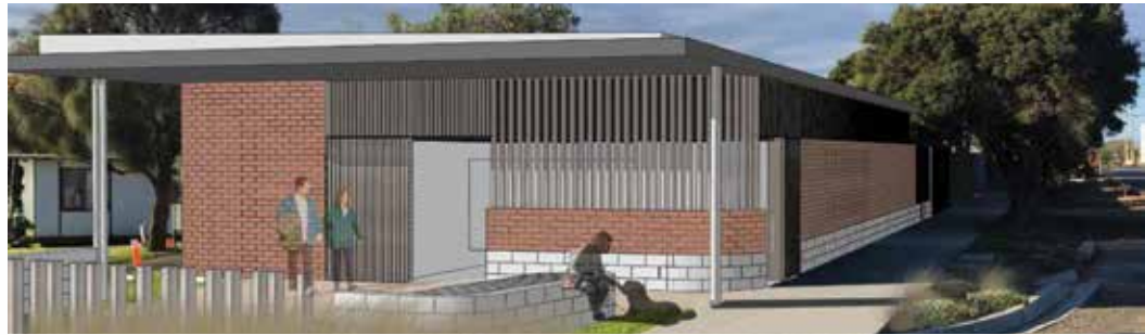
An artist's impression of how the new amenities block will appear from the Queenscliff Recreation Reserve's Hesse Street entrance.