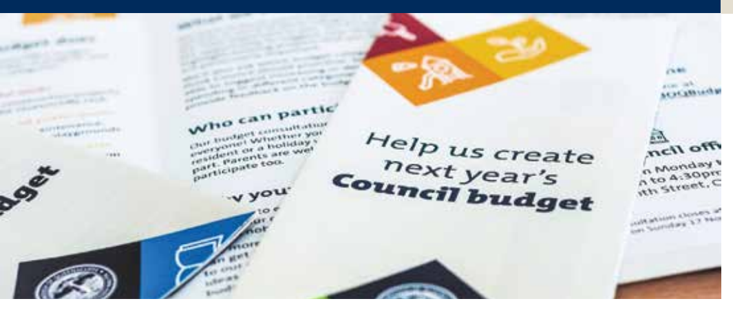
Borough residents are again invited to have their say as part of an expanded budget consultation.

Like most other Councils in Victoria, the Boaters and fishers in Queenscliff and across the wider Bellarine will have a smoother summer on the water with the boat ramp upgrade officially completed in late August. The upgrade project, conducted by Better Boating Victoria in partnership with Council, brings a new third lane to the ramp alongside a new concrete surface, new central pontoons and upgraded outer pontoons. A 24/7 ramp camera is available to view on the boating.vic.gov.au website so you can check the traffic before deciding whether to launch. Happy boating!