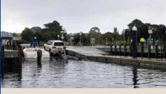
The Queenscliff Boat Ramp is officially open for use.

The Hub's planned official opening with key stakeholders and funding partners was unfortunately delayed, but a rescheduled opening was planned to take place during the week of publication.