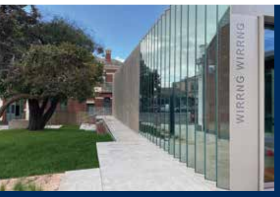
The façade of the Hub reflects nearby historical architecture onto its surface, while proudly displaying the 'Wirrng Wirrng' name at its edge.