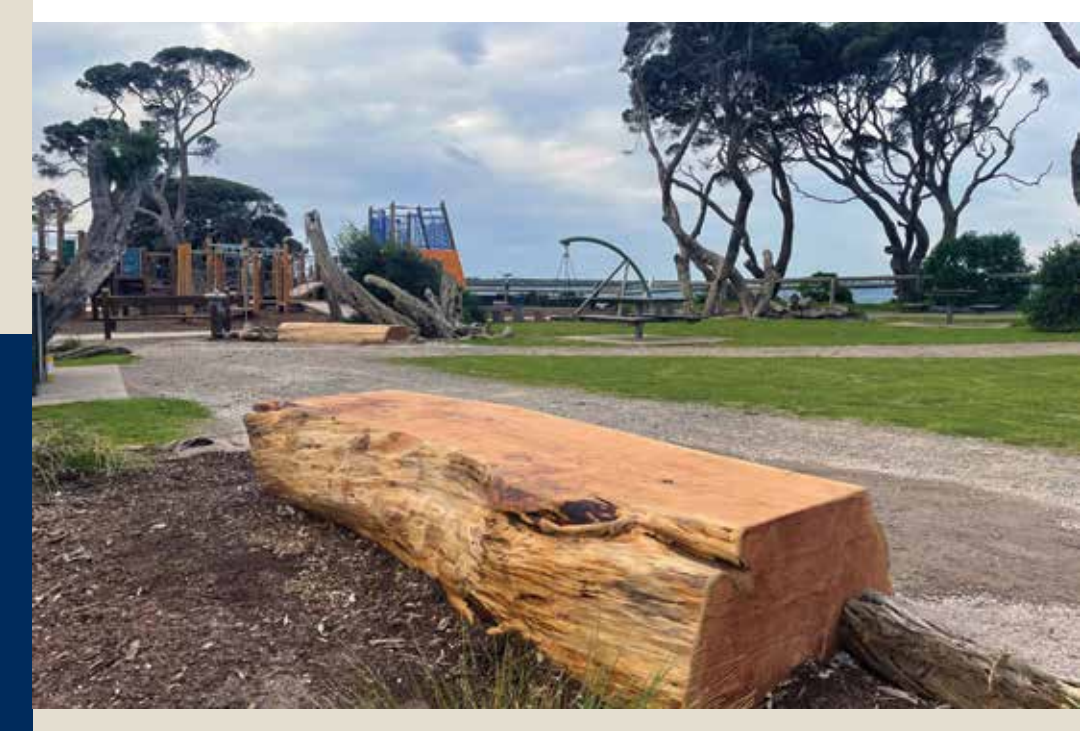
Three new timber log bench seats have been installed at Point Lonsdale Foreshore.

More information about the CERP is available at boq.news/cerp.