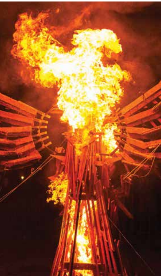
Burning sculptures were a feature of the Low Light Festival.