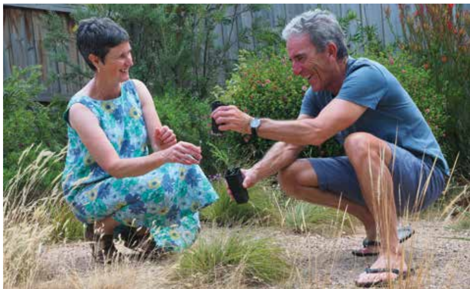
The Swan Bay Environment Association's Gardens for Wildlife program received one of Council's environmental grants.

Sign up today at queenscliffe.enotices.com.au