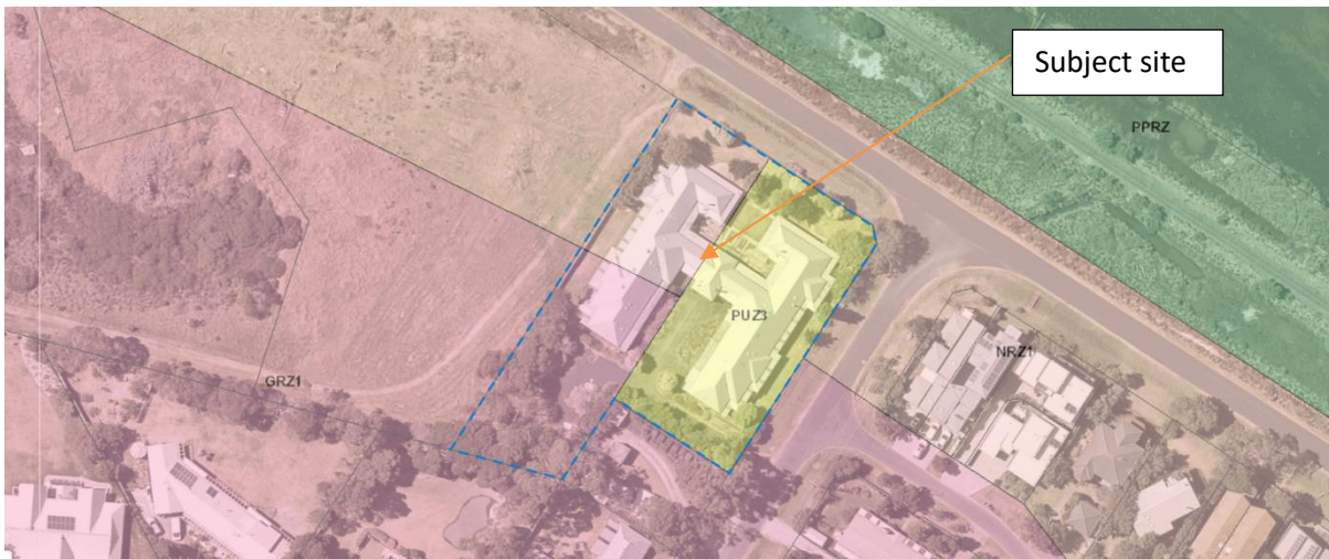
Figure 1: Aerial photo 81 Nelson Road, Queenscliff with current mixed zoning and overlay controls

The subject site was previously used as an aged care facility and the building still exists on the site. The use ceased operation prior to 2005 and the site is no longer used for this purpose. Constructed in the early 1990s, the existing facility is no longer capable of meeting the current requirements and expectations of the aged care industry, and the existing structures are progressively falling into a state of disrepair.