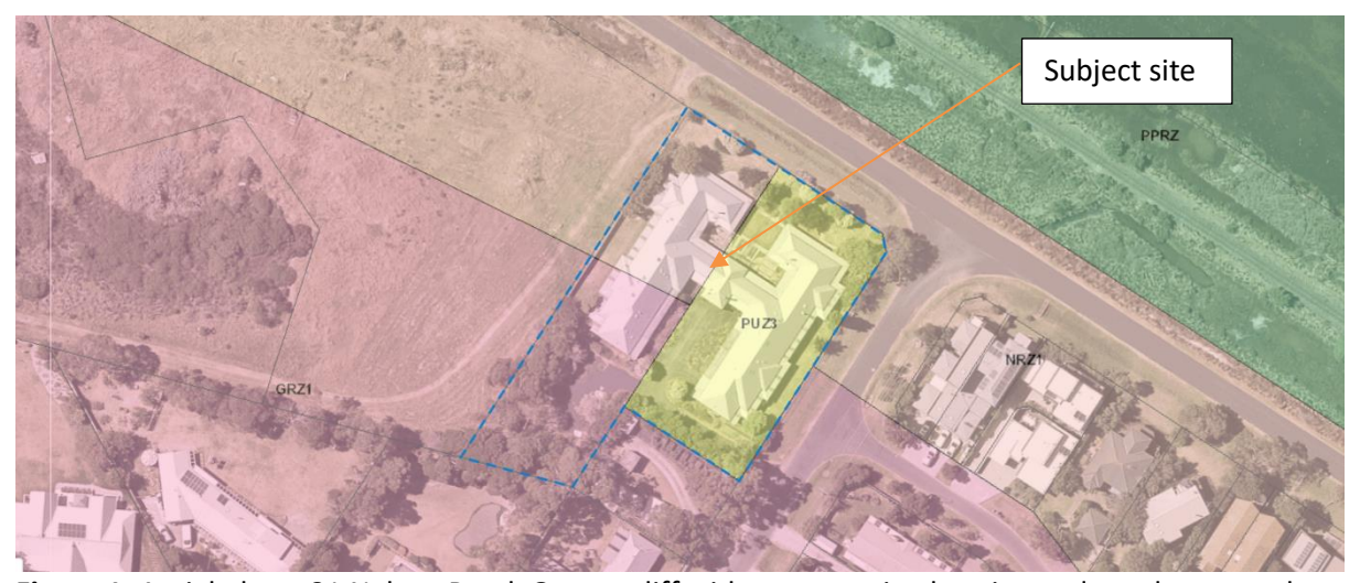
Figure 1: Aerial photo 81 Nelson Road, Queenscliff with current mixed zoning and overlay controls

The subject site was previously used as an aged care facility and the building still exists on the site. The use ceased operation prior to 2005 and the site is no longer used for this purpose. Constructed in the early 1990s, the existing facility is no longer capable of meeting the current requirements and expectations of the aged care industry, and the existing structures are progressively falling into a state of disrepair.