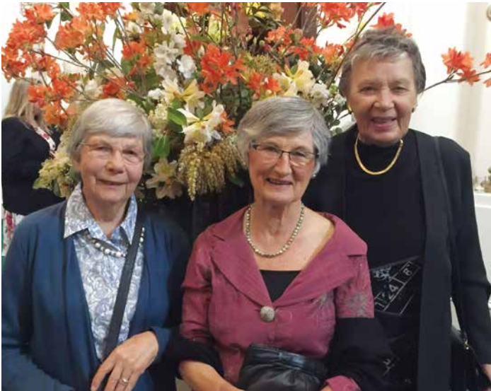
Council's local Seniors Festival events included a visit to Government House.