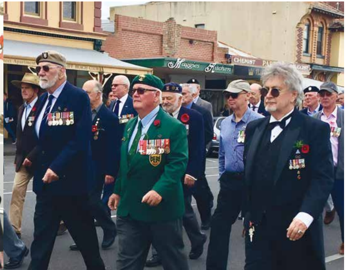
The community paused to reflect on Remembrance Day 2018.