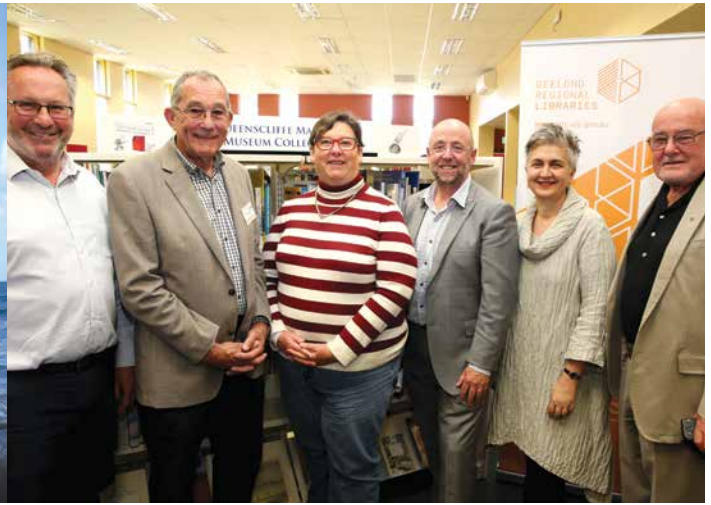
Celebrating the inclusion of the Queenscliff Maritime Museum's book collection into the Geelong Regional Libraries catalogue.