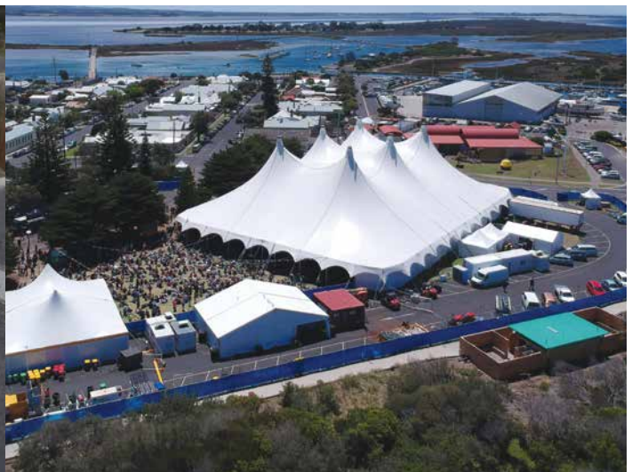
The 2018 Queenscliff Music Festival attracted the usual crowds of happy music lovers.