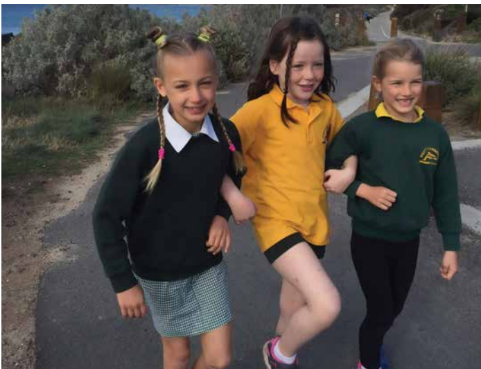
Local primary school students stretched their legs on Walk To School day.