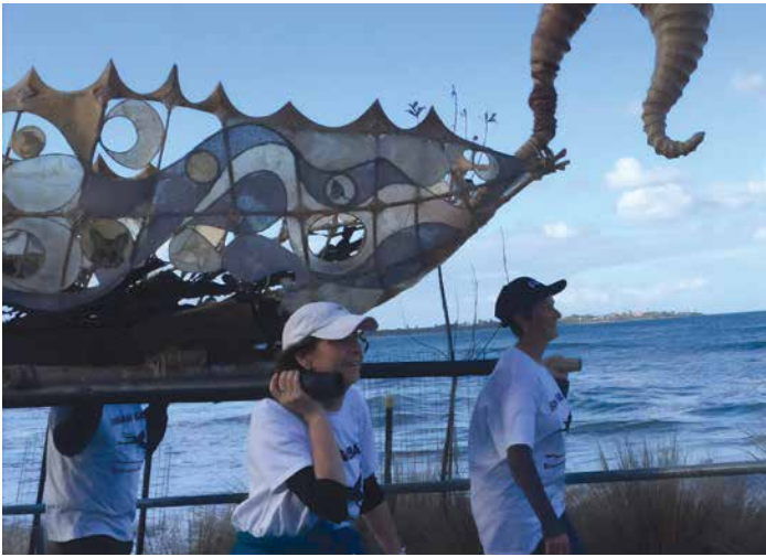
Canoe, the famous lead commission of Mountain to Mouth, passes through the Borough.

Council is proud to participate in a wide variety of events and activities in partnership with local businesses and organisations. Here are some highlights from 2018.