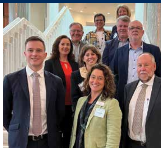
Mayor Tolhurst together with representatives from City of Greater Geelong, Surf Coast Shire, Colac Otways Shire Council and Golden Plains Shire Council.

See your most recent Rates or Animal Registration Notice for instructions on how to register with your unique eNotices registration code, or contact Council for assistance.