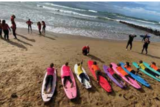
Groms off the Wall.