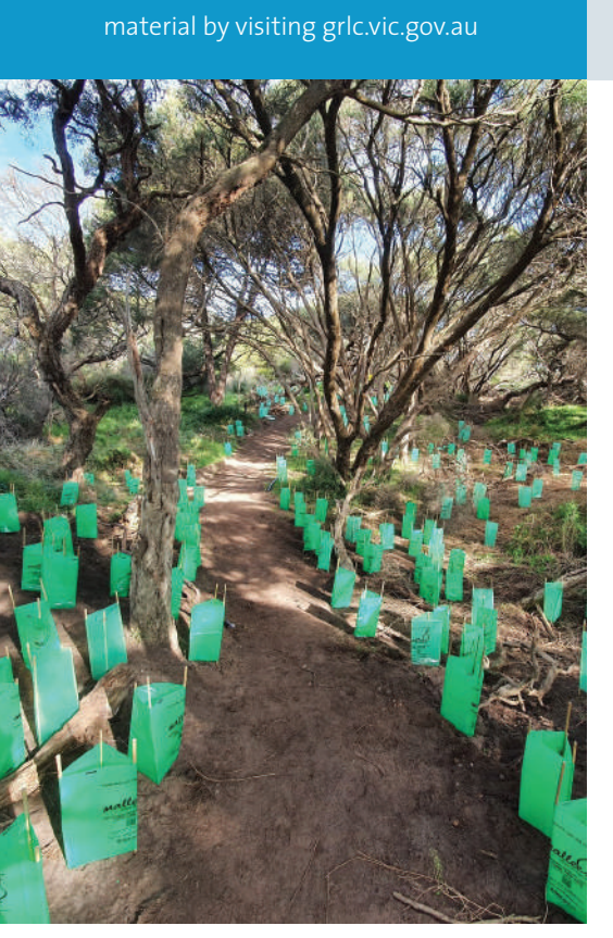
Hundreds of new trees, shrubs and aroundcovers have been planted in Point Lonsdale's Bunny Woods foreshore area.

collection and a range of other exciting