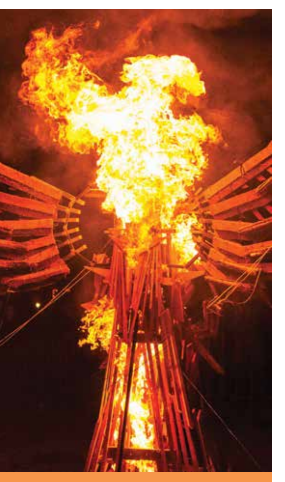
Burning sculptures were a feature of the