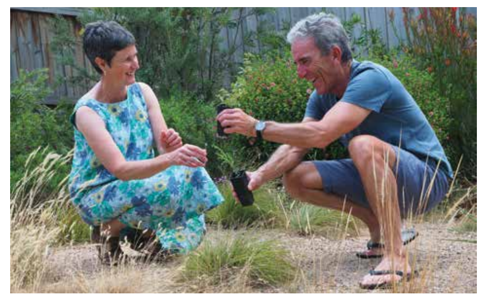
The Swan Bay Environment Association's Garden's for Wildlife program received one of Council's environmental arants.