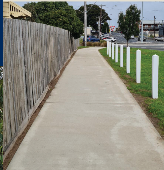
A new footpath has been installed joining Hesse Street to the boat ramp precinct.

A new handrail has also been installed, improving user safety.