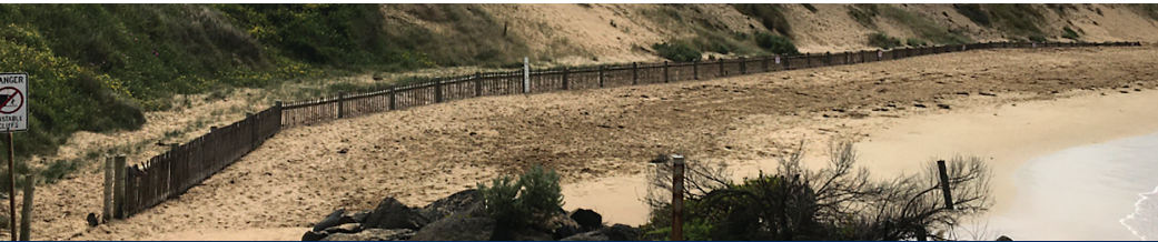
Fencing will be continued along the dog beach, improving safety measures for dog beach users.