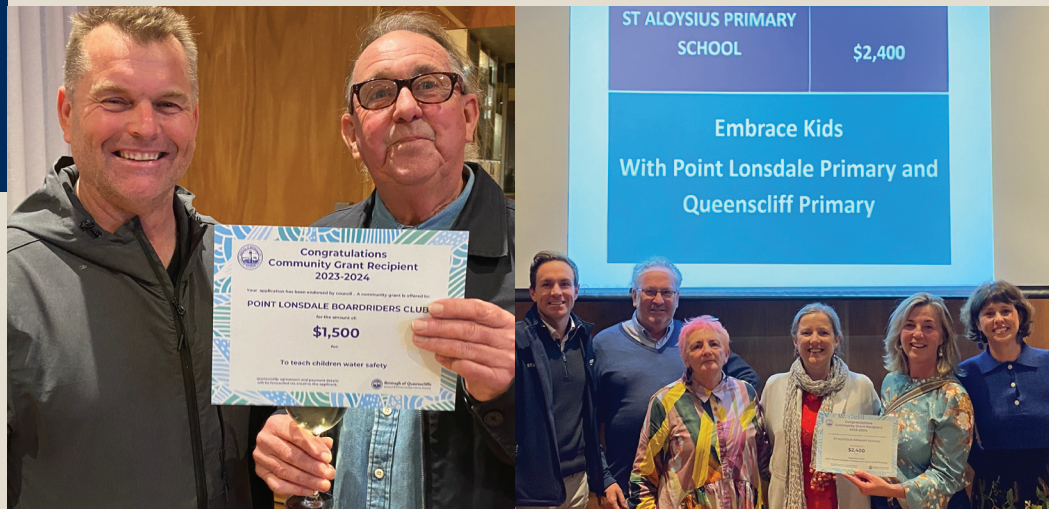
Last year's grant recipients included local primary schools and Point Lonsdale Boardriders Club

For further details on what can be dropped off please visit our website – boq.news/eWaste