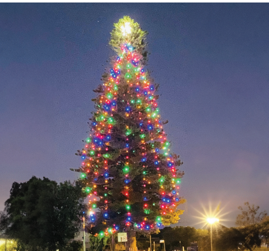
At 45 metres tall, the Christmas tree in Point Lonsdale is a sight to behold