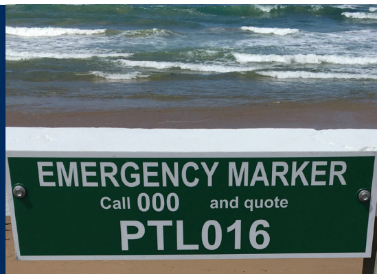
New emergency marker signs enable accurate location information to be shared with Triple Zero.

If you find yourself in need of emergency