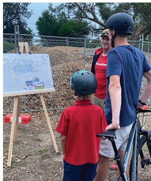
The drawings look great; now we are looking for funding to bring the vision to life.

The CFA website provides a wealth of information including details on restrictions concerning barbecues, the use of chainsaws and mowers and other activities you may not have considered to pose a fire risk. For further information, head to the CFA website. cfa.vic.gov.au