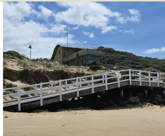
Work at the Point Lonsdale Back Beach ramp was prioritised for summer beach patrol

In the coming months we will continue to work on the planning and approvals required to fix the dog beach access ramp.