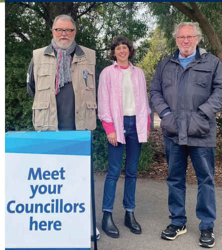
Chat with Councillors at Listening Posts across the Borough over the coming months.